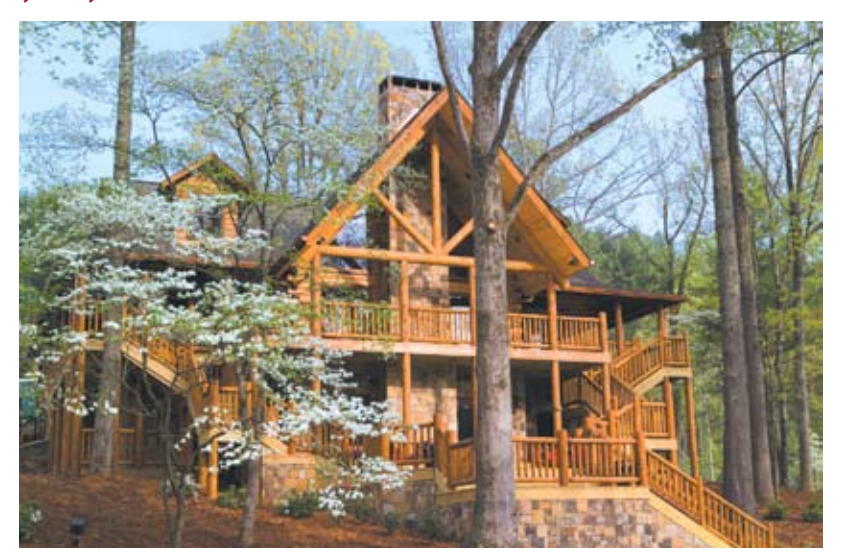
Satterwhite Log Home

he decision to make improvements to your home, or even to do just regular maintenance on it, has become a tougher choice for many homeowners today. Our economy has left families with less money and lots more uncertainty about the future. So when it comes to maintaining what may be your family's biggest asset, your home, resources are tighter than before. We hear you!