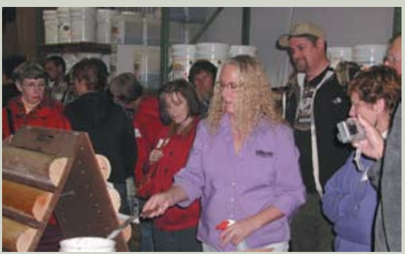
Workshop in Stevensville, Montana