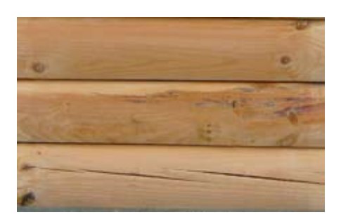
after using Log Wash