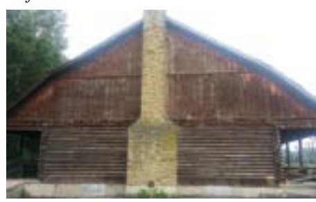
The work was donated by Legion members and took place on weekends