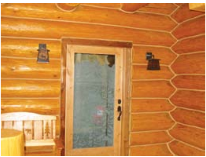
Perma-Chink and Energy Seal sealants applied around window frames, door frames, corners to keep the house weather tight.