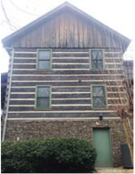
Before cleaning with Cedar Wash