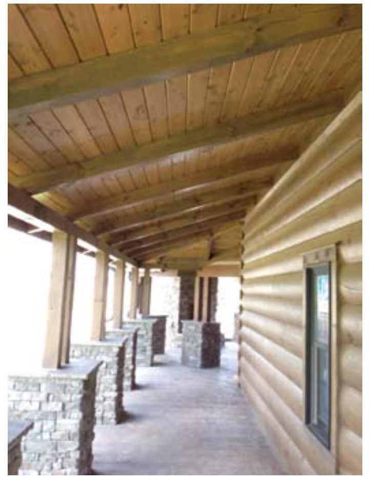
Lifeline Ultra-7 stain in color Smoke with Lifeline Advance Gloss cleat topcoat

Applicator: Mountain Top Log Home Restoration, Peter Malkmus (stain/sealants)