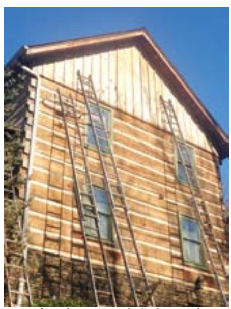
After cleaning with Cedar Wash